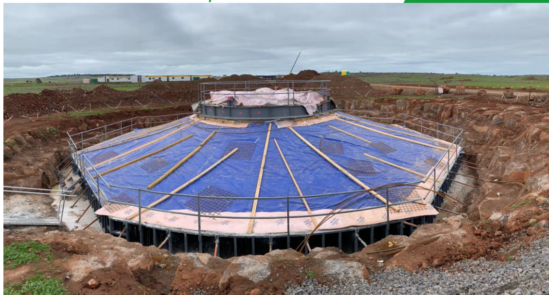
Thermal blankets cover poured foundation

The Tilt Renewables team is underway with constructing the $560 million Dundonnell Wind Farm located approximately 23 kilometres north-east of Mortlake, in the Western District of Victoria. AusNet Services are constructing 38 kilometres of 220kV transmission line and a substation which will connect the wind farm to the electricity network.