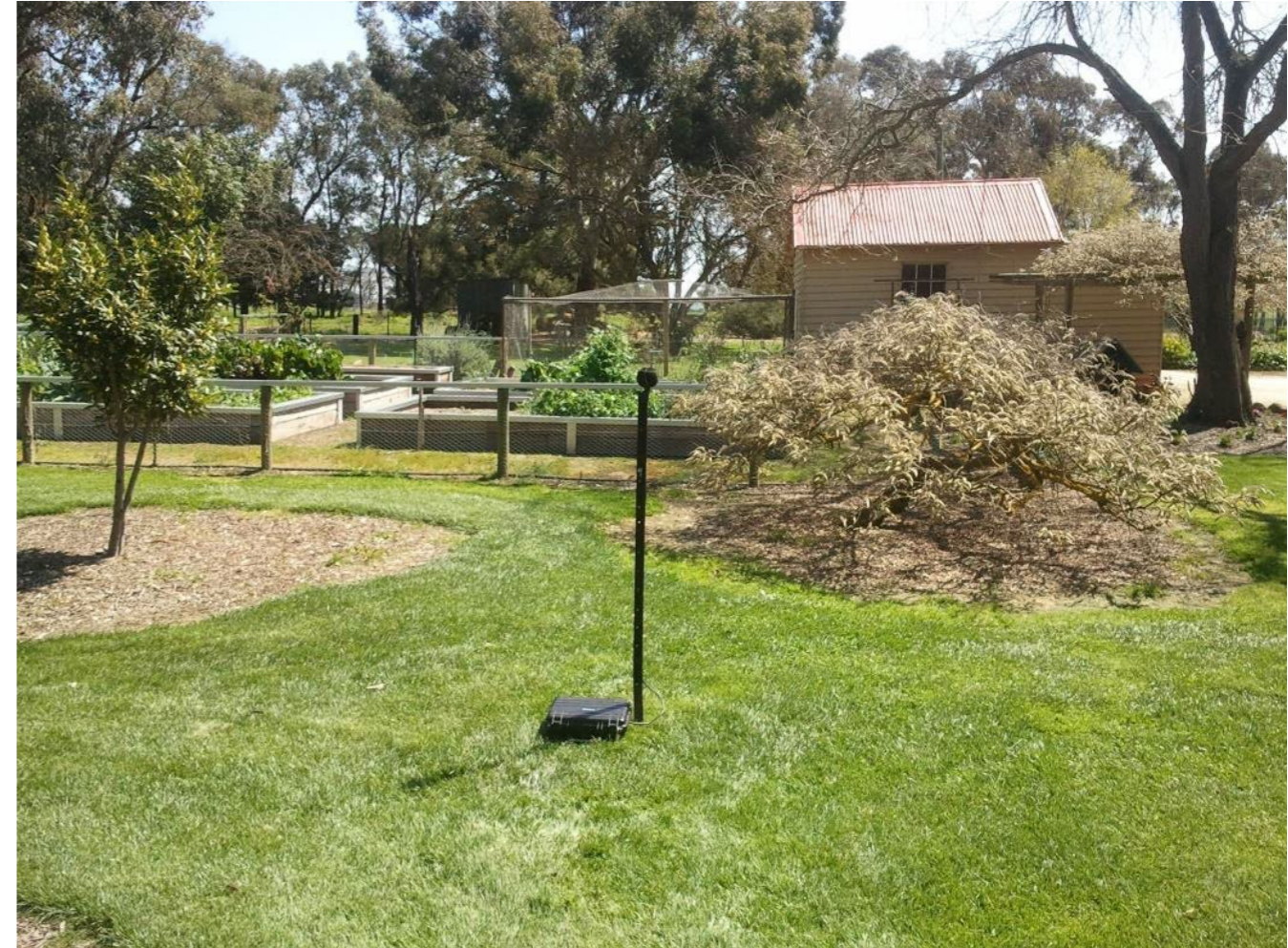
Example of a noise logger