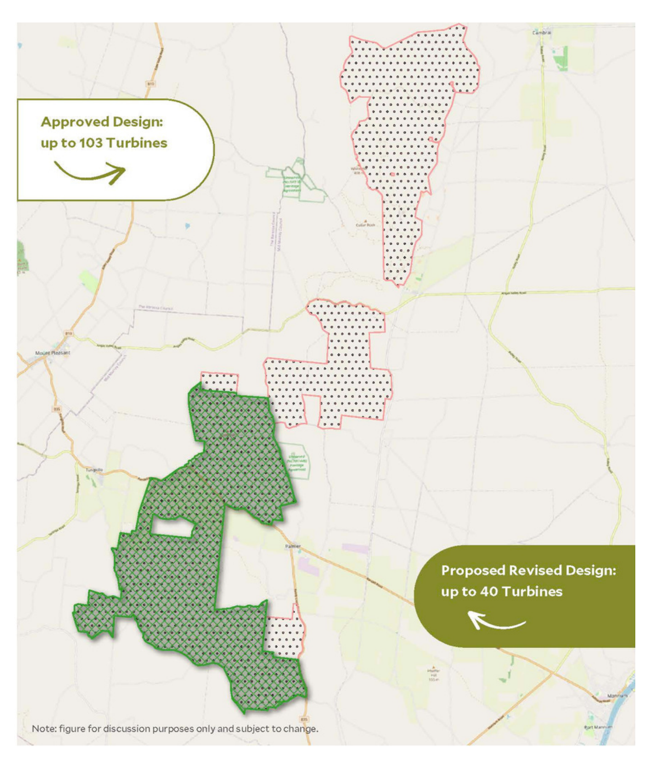
Figure 1: The Varied Project area