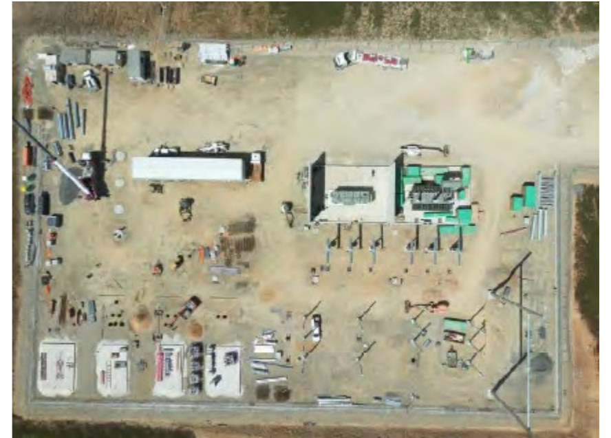
Northern Substation Progress