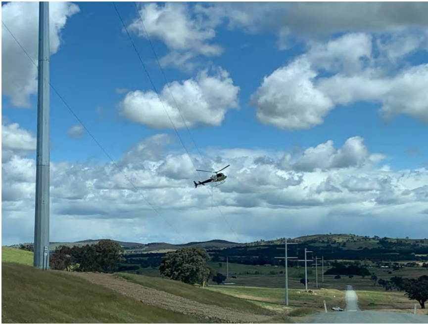
330kV Overhead Line using a helicopter