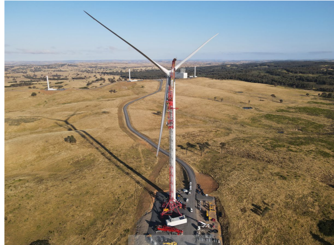
First completed turbine