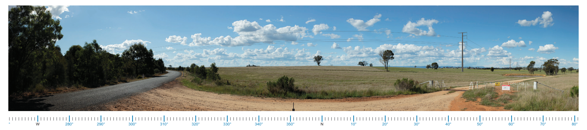
RTS Project View