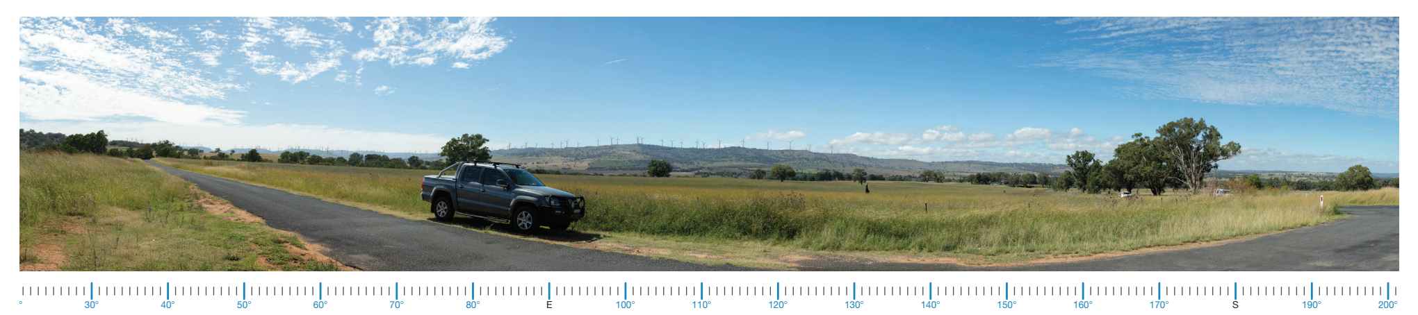
Approved Project View