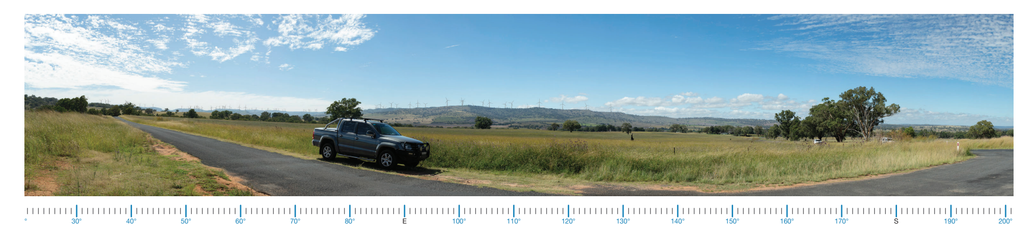
RTS Project View