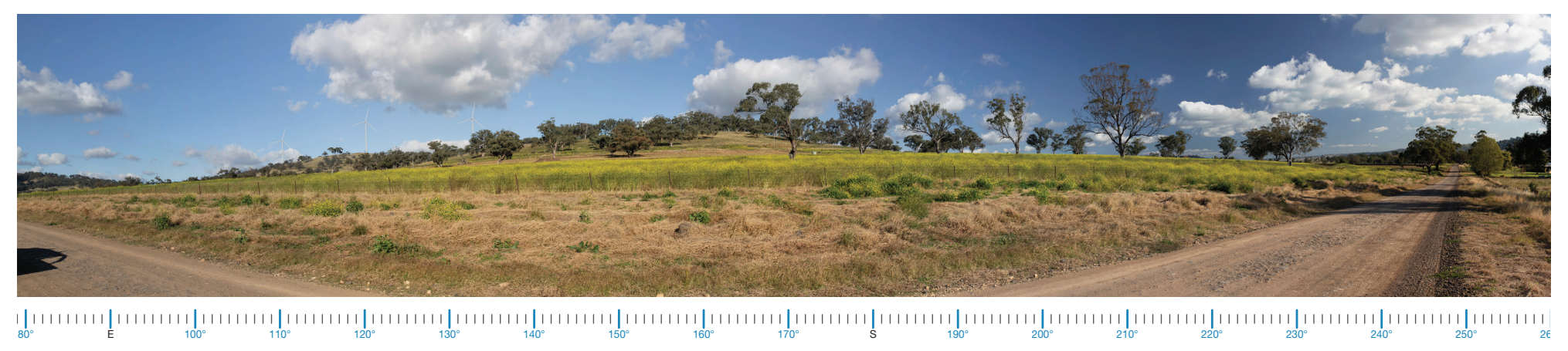
Approved Project View