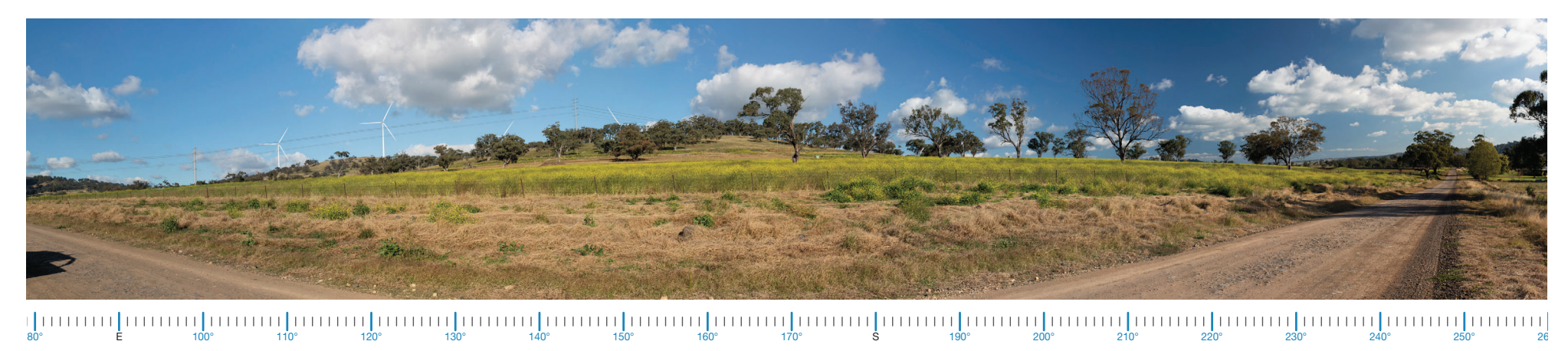
RTS Project View with Transmission Poles