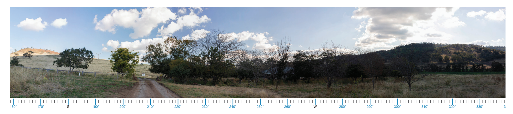
RTS Project View