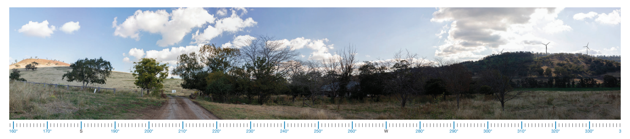
Approved Project View