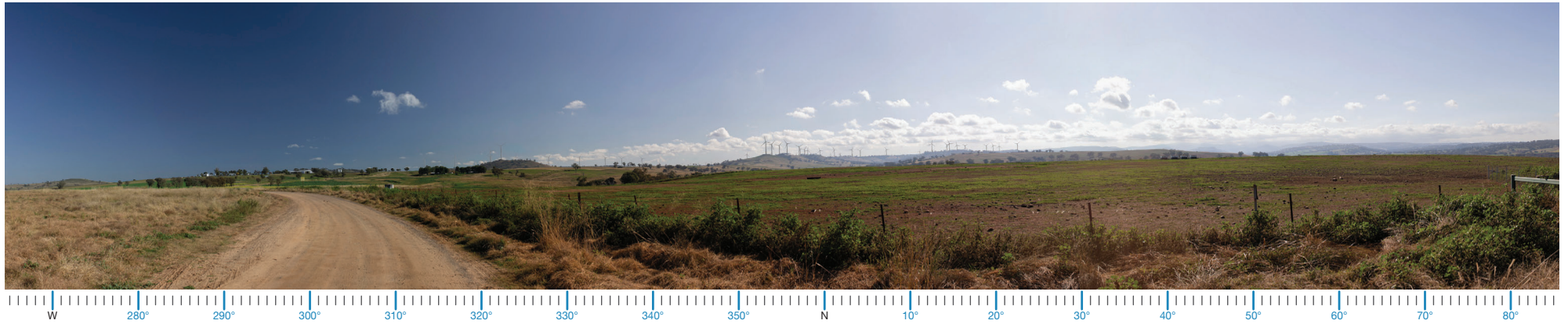
Approved Project View