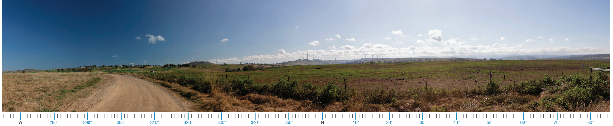
RTS Project View