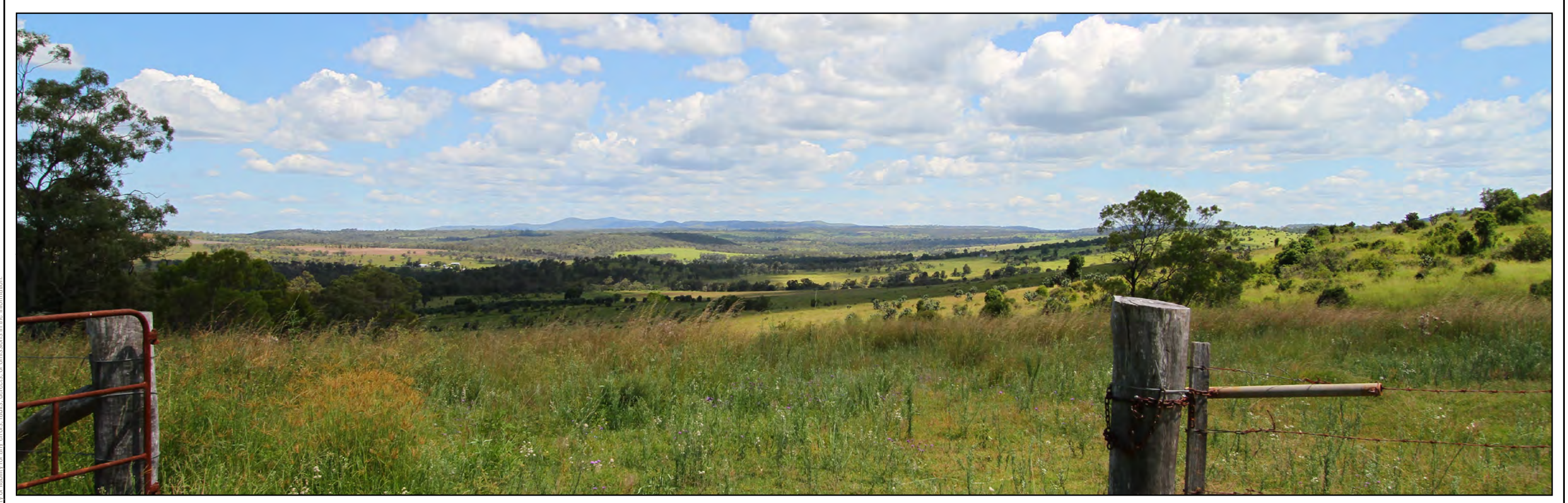
Photomontage view from Viewpoint 6: Elevated southerly views from Ironpot Road

Existing view from Viewpoint 6: Elevated southerly views from Ironpot Road