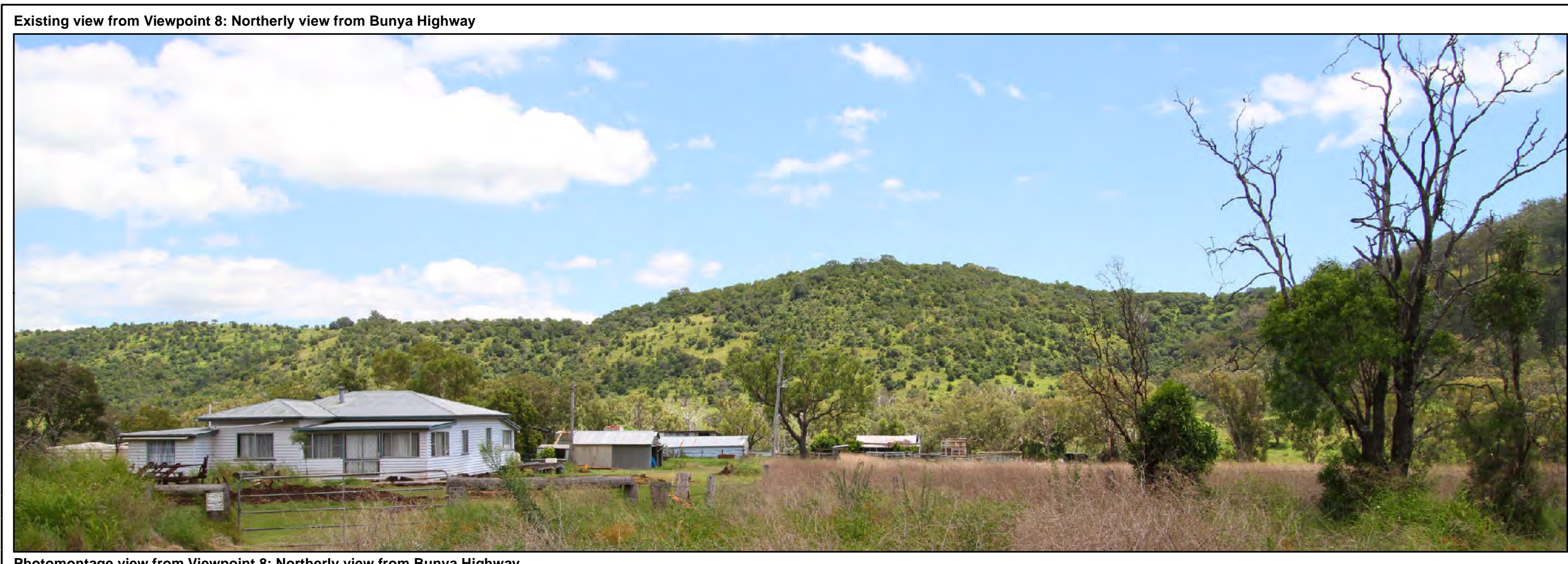
FIGURE 5.17 - VIEWPOINT 8