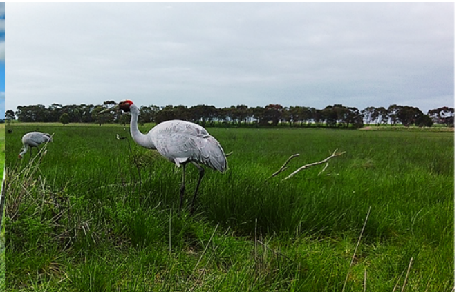
Figure 2: Brolgas foraging