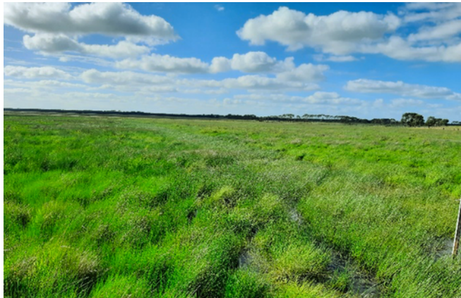
Figure 1: Wetland habitats

Implementation of the Bat and Avifauna Management Plan is ongoing. The Year 2 report is still being assessed by the Department of Energy, Environment and Climate Action and Moynes Shire Council. Once approved, the final Year 2 Annual Report will be made available on the Tilt Renewables website. We are currently drafting the Year 3 report. The annual noise compliance statement has been submitted to the Environmental Protection Agency (EPA).