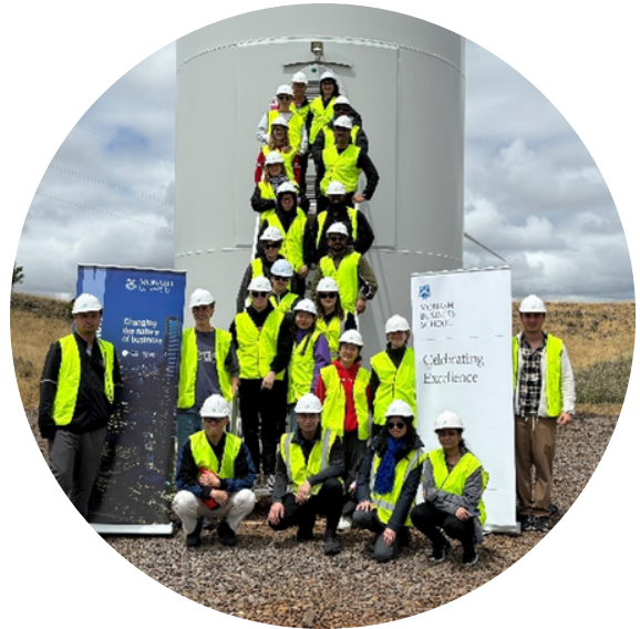
Figure 3: Monash University students gathered at the base of a wind turbine.

With the clean economy projected to require 2 million jobs by 2050, we believe it's crucial to establish as many connections with the education sector as possible. The visit presented a valuable opportunity to strengthen our relationship with Monash University and provide them with meaningful insights into our operations.