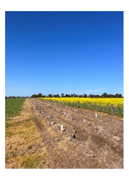
Figure 5: Photos of tree planting efforts made by the Lismore Land Protection Group