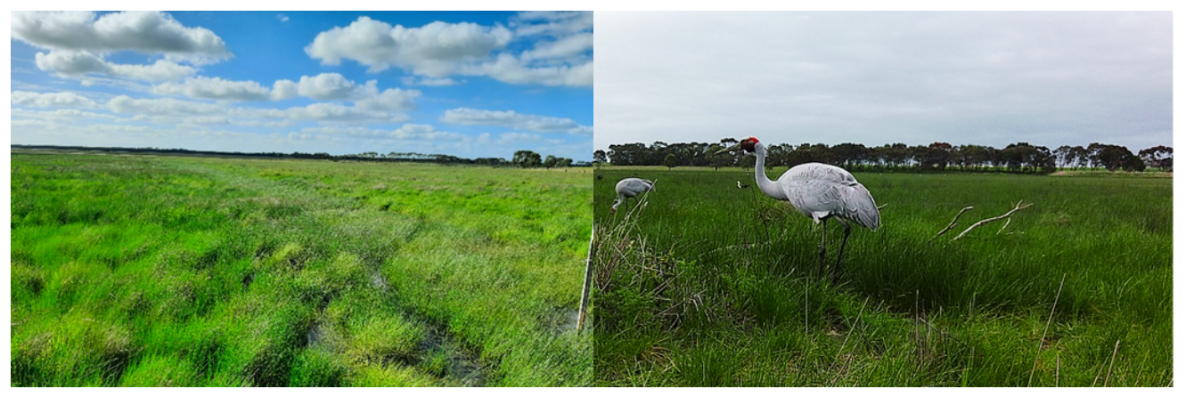
Figure 1: Wetland habitats

Implementation of the Bat and Avifauna Management Plan is ongoing. The Year 2 report is still being assessed by the Department of Energy, Environment and Climate Action and Moyne Shire Council. Once approved, the final Year 2 Annual Report will be made available on the Tilt Renewables website. We are currently drafting the Year 3 report. The annual noise compliance statement has been submitted to the Environmental Protection Agency (EPA).